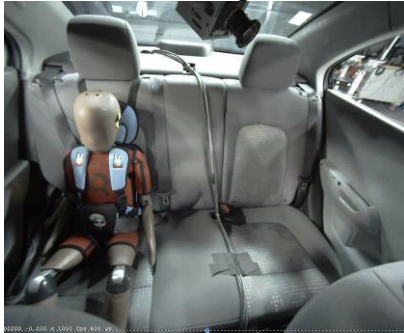
Before the side impact

The photos below show a side-impact crash test at 32 km/h (almost 20 mph), striking on the driver's side, with a seat attached with the shoulder-lap belt. See what happens in 167 milliseconds into the crash. Would you want your child riding at such risk?