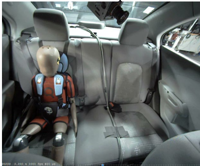
Before the side impact

The photos below show a side-impact crash test at 32 km/h (almost 20 mph), striking on the driver's side, with a seat attached with the shoulder-lap belt. See what happens in 167 milliseconds into the crash. Would you want your child riding at such risk?